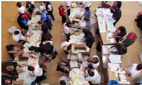
Create a Project