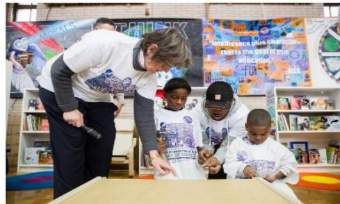
Signature Site at Girard College