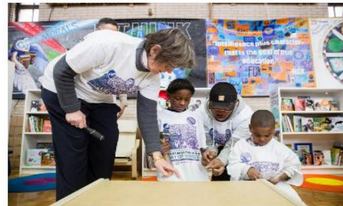
Signature Site at Girard College